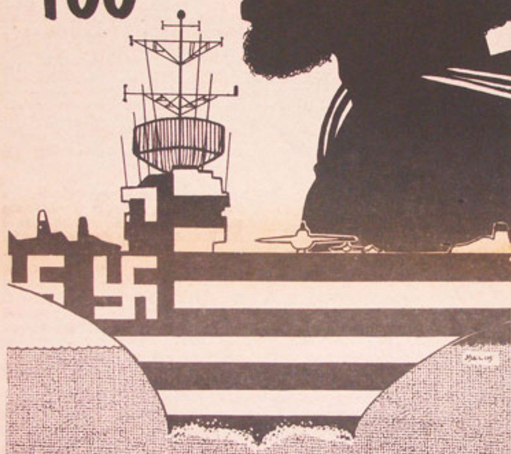
Despite its facade of "improving race relations", Black seamen find the U.S. Navy as racist as the rest of American society.

The U.S. armed services has historically reflected the racism which permeates every sector of American society. The treatment which Black people and other minorities receive in the military follows the general pattern of the ordeal we face in so-called civilian life. The injustices and mistreatment we receive throughout all branches of the military provides us with a mirror image of the racist arrogance of white America.