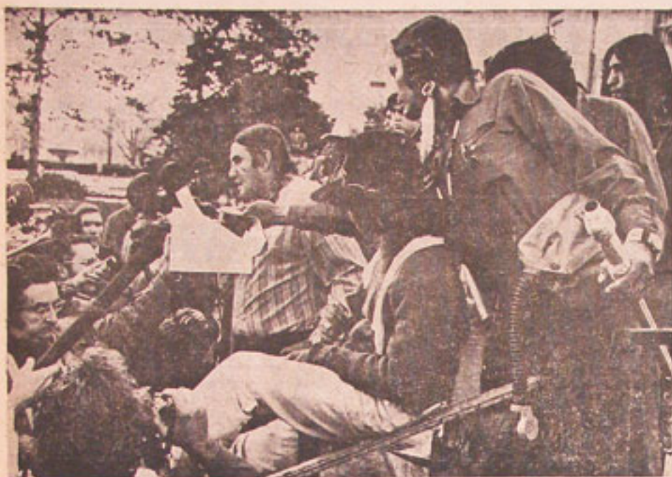
300 tribes of Native Americans gathered in Washington, D.C., to demand the U.S. government fulfill all broken treaty obligations.

NATIVE AMERICANS SEIZE BUREAU OF INDIAN AFFAIRS BUILDING IN WASHINGTON, D.C.