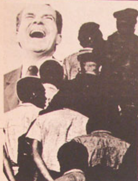
Nixon's re-election means four more years of insanity, slaughter and suffering.

In this year, 1972, the American people had the option either to elect new ideas and representatives or to continue blindly with the same warmongering, racist power bloc. If we think of the American people as all of us, then the manner in which 'we' voted would make it seem that we are digging our own graves. However, not all of us voted. Poor people, oppressed people, Black people, have never voted in great numbers for a president. It is an election which seats a man we have no control over; this election has always voiced the ideas we have not and will not benefit from until the entire government is changed.