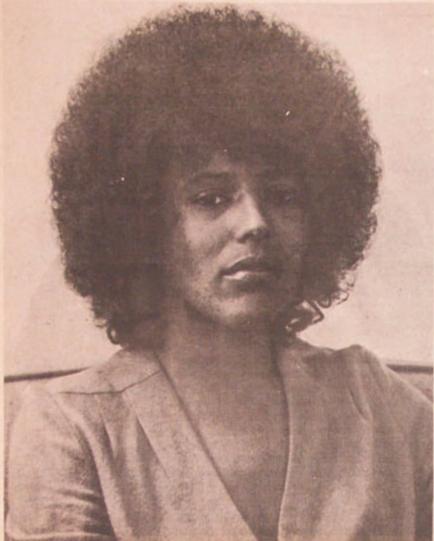
ELAINE BROWN: "Let's start here in the city of Oakland, implementing people's power in the United States and people's power all over the world."