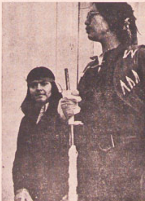
"Indian people are now standing straight and tall. This is our country, this is our land. We have the right to live and thrive."

The above statement of support is from the Black Panther Party, Washington, D.C. Chapter, for the "Trail of Broken Treaties" caravan, which represented 300 tribes of North American Indians who began to gather in Washington, D.C. on October 30th, to demand the government's fulfillment of all United States treaty obligations and the protection of Indian people's rights to water, minerals and land.