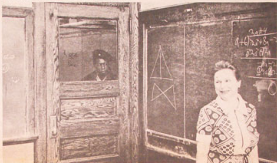
White classrooms suddenly become "overcrowded" when it is discovered that Black students are planning to attend.

register their children in school. During this time, 18 Black parents were arrested for "trespassing", at P.S. 285 and at the school board. The racist arrests of the protesting Black parents did not serve its purpose: to